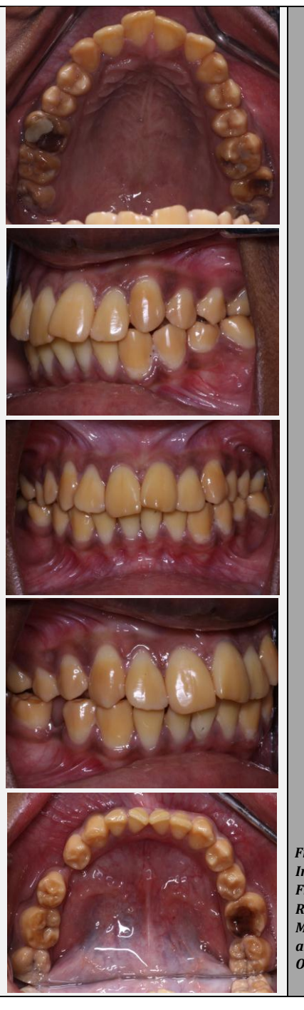
Figure 3. Intraoral-Centric Frontal, Right and Left, Maxillary and Mandibular Occlusal

5. A Deprogrammer (Lucia Jig) was given to the patient for 30 minutes after which a centric bite was taken at the vertical dimension of occlusion. A Facebow record was made using the UTS 3D Ivoclar Vivadent facebow.