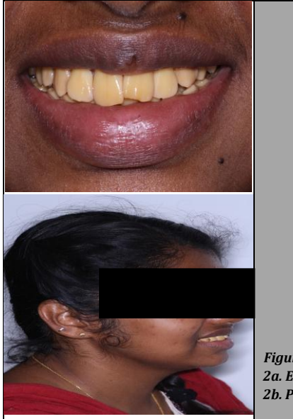
Figure 2a, b: 2a. Extraoral - Close Up Smile 2b. Profile Smile